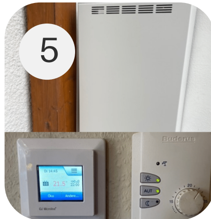
Connect Transformer & Thermostat