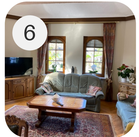
Complete Look & Enjoy Your Comfort Heat