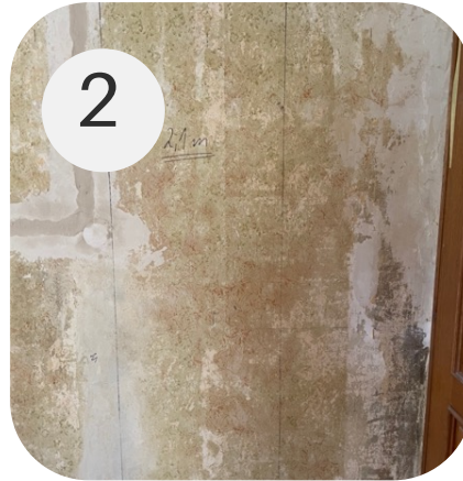
Scrape wall paper & fill in cables