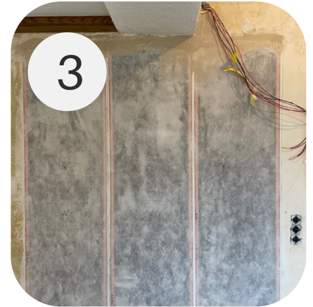
Apply Heating Film